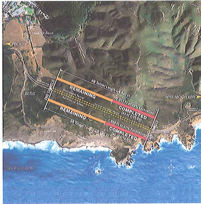
Caltrans > District 4 > Devil's Slide