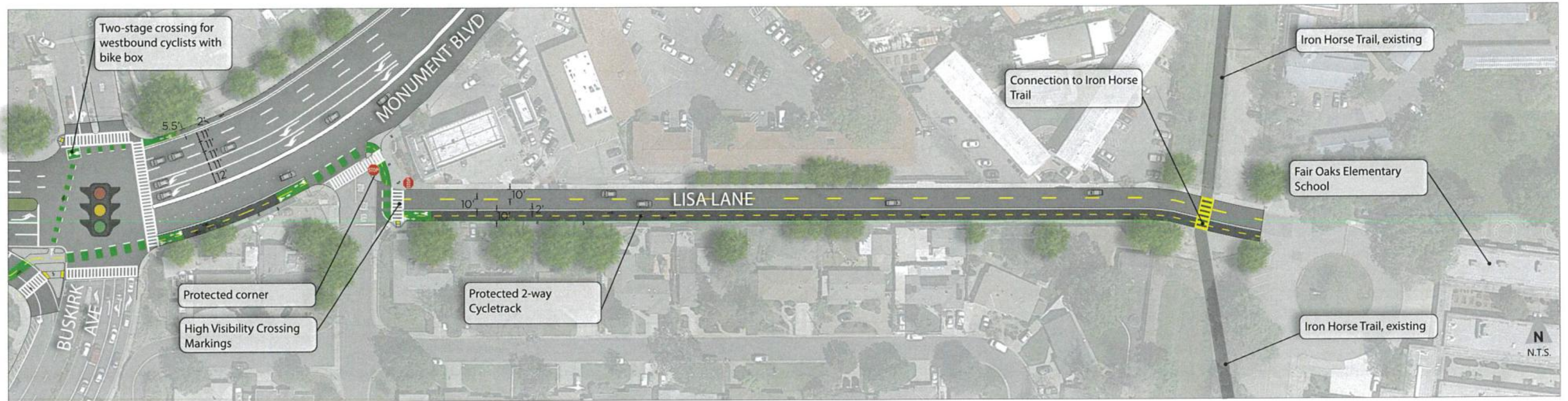
ALTERNATIVE A - LISA LANE