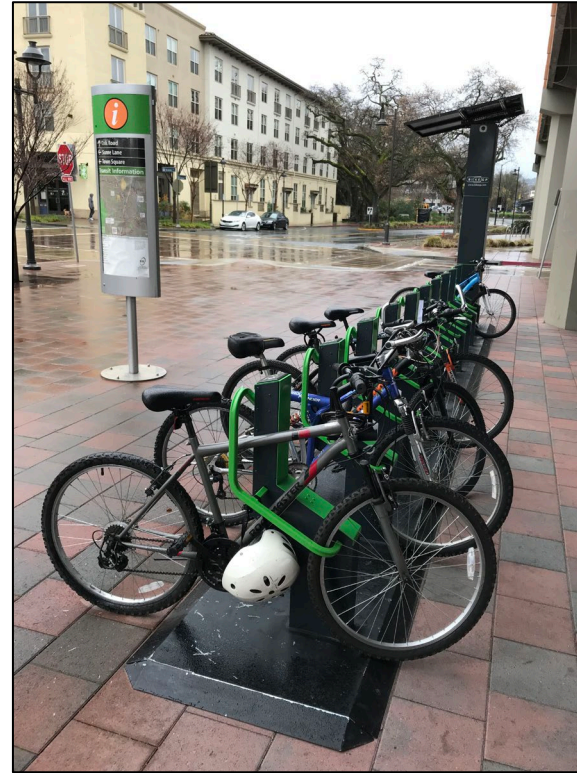
Pleasant Hill Bikekeep Racks